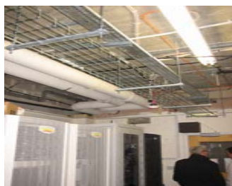
New Power Cable runs