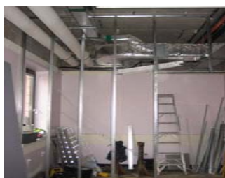
New Server Room Access Area

Both construction stages will have new Air Conditioning Units, Power Cabling, Raised Floor, Server Racks, Switches and Network links that will be capable of 10 Gigabit communication speeds.