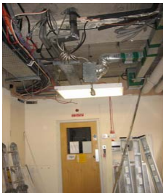
Ceiling in Systems Room being removed

Sturrock Power our main contractor has started construction on the new Server Room. They are working closely with lead design consultants RSP.