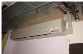
New Air Conditioning Unit

Stage 2: Upgrading of the existing Server Room to a new standard to compliment the new area.