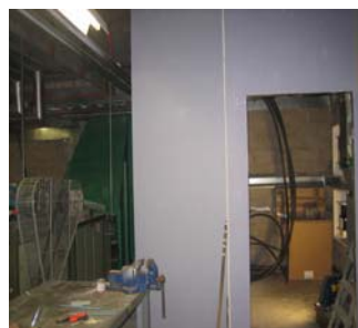
New UPS Area in Plant Room

There will also be a new Failover Power Supply (UPS) area built in the Plant Room area adjacent to the Server Room. This will have the capacity to house 4 large UPS systems but will initially house 3. This will ensure adequate failover supply for all our servers and network equipment that will be housed in the new area.